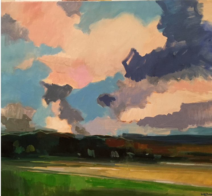
“Eugene, Summer of 2018”, 2019

Café Soriah is located at 384 W. 13 th ave in Eugene. Café Soriah a Eugene favorite for more than 20 years, Cafe Soriah brings the Mediterranean culinary experience to life with their passion for using the freshest bounties of the Pacific Northwest and exceptional service.