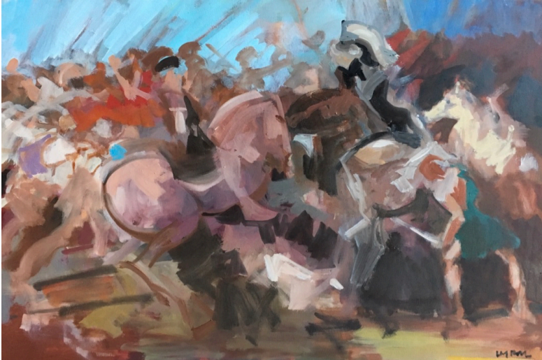
“The Battle between Constantine and Licinius”, 2019